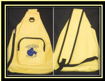
Convention Sling Bag + Notebook $20.00 (plus shipping)